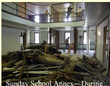
Sunday School Annex—During